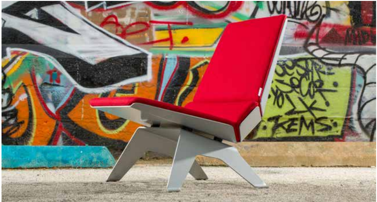
Shown Above: ALMG Chair