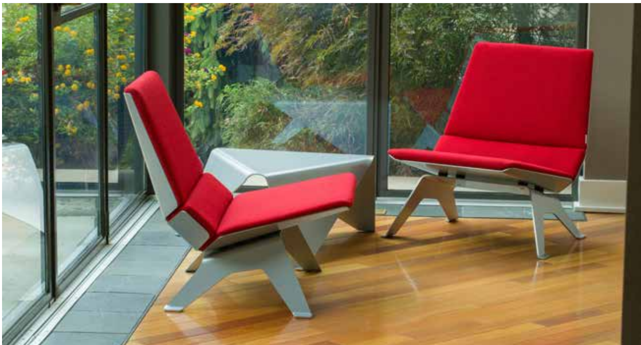
Shown Above: ALMG Chairs in Blazer Handcross with the ALMG Table.